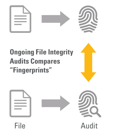
Figure 2: Unique fingerprint enables recurring checks for corrupted files.